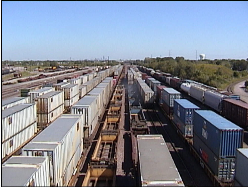
Figure 1 General freight in the Proviso Rail Yard Chicago, Ill

The operational advantages of dedicated trains are very straightforward. Instead of intermittent individual shipments traveling simultaneously on a relatively large number of routes, it will be possible to assemble the shipments into three to five cask consists, and ship them across country without the delay or the complexities of removing individual waste casks from general freight traffic.