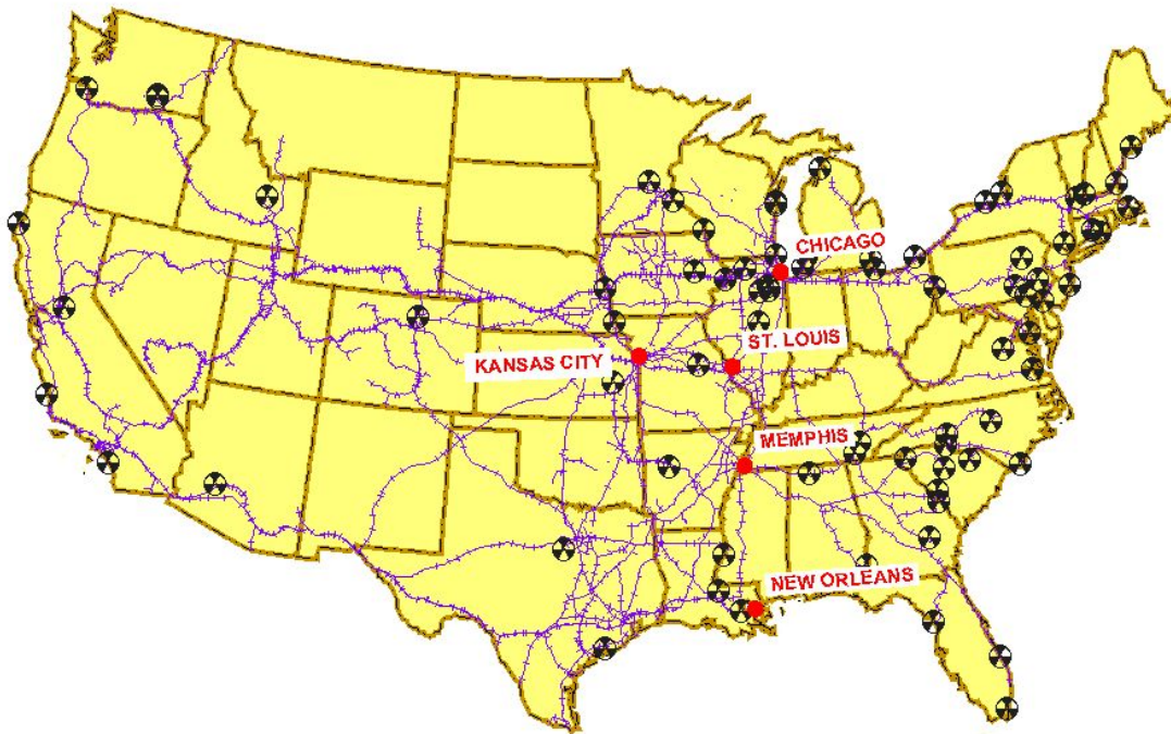
Figure 2 Union Pacific Gateways and Kansas City

In the consolidated scenario, SNF and HLW is routed to one of four “gateways.” These gateways are: Chicago, St. Louis, Memphis, and New Orleans. From these four gateways, the waste then travels to Kansas City and then on to Yucca Mountain via Kansas, Colorado, Wyoming and Utah. The consolidated scenario routes all shipments to Kansas City before sending them west to Yucca Mountain.