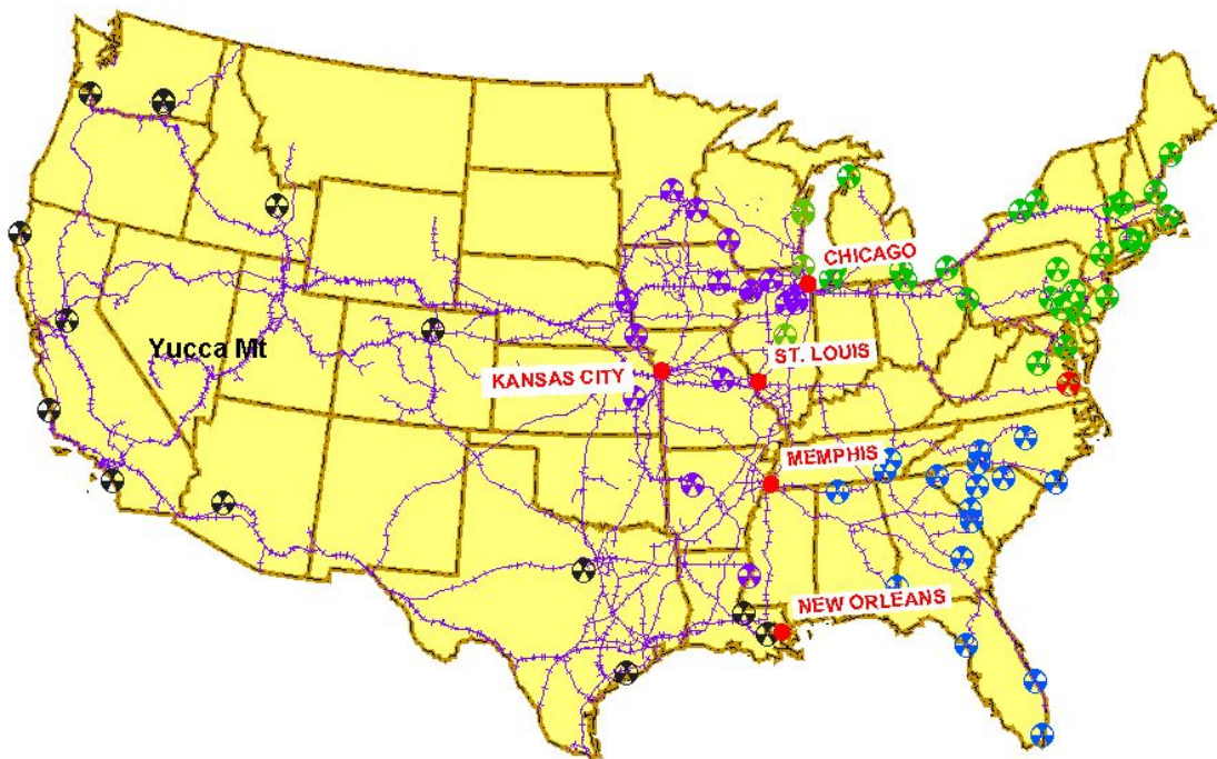
Figure 3 Shipping sites partitioned by network

In order to assess the impact of the consolidated routing scenario, the network was partitioned based on the location of the shipping sites, the network partitioning was then used to determine which minimum distance from each shipping site to a node representing each Union Pacific gateway. This analysis assumes that no waste will be shipped through Gibbon Junction in Nebraska or the Moffett tunnel west of Denver. Therefore waste would move north from Denver and then west to Yucca Mountain. This was done to assign each shipping site to a gateway location. Then a minimum distance was calculated between each shipping site and an appropriate gateway. A number of sites were not appropriate for gateway shipments. These shipments were routed directly to Yucca Mountain.