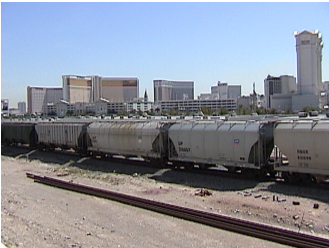
Fig. 5. Union Pacific Railroad through downtown Las Vegas.

The actual number of rail-cask shipments to Caliente through Las Vegas could be as high as 8,564 over 24 years, or about 89 percent. DOE current policy is that rail carriers will determine the routes used for shipments to Yucca Mountain. Alternative cross-country rail routes are available, and a number of factors could result in the vast majority of shipments from the East traveling to Nevada on the Burlington Northern-Santa Fe or Union Pacific routes across Texas, New Mexico, Arizona, and California. All rail shipments to Yucca Mountain, except those from the Pacific Northwest and Idaho, could therefore travel to Caliente through downtown Las Vegas under credible alternative routing scenarios. (15)