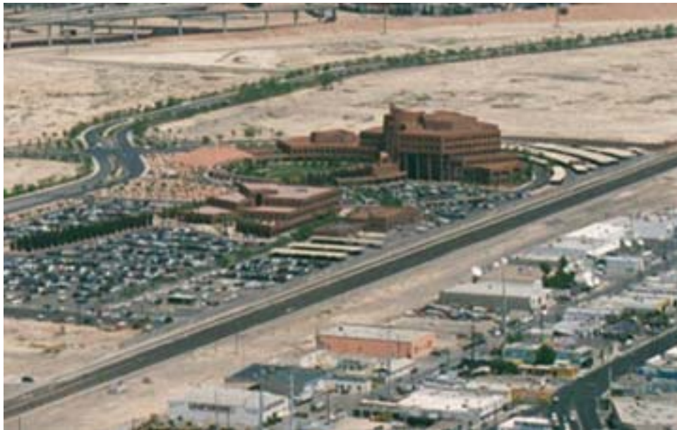
Fig. 6. Clark County Government Center, downtown Las Vegas.

Many thousands of Las Vegas residents live and work near this potential rail route to Yucca Mountain via Caliente. According to the 2000 Census, more than 39,000 people reside within one-half mile of the Union Pacific mainline, between Apex Siding on the North and Arden Siding on the South. When the resident