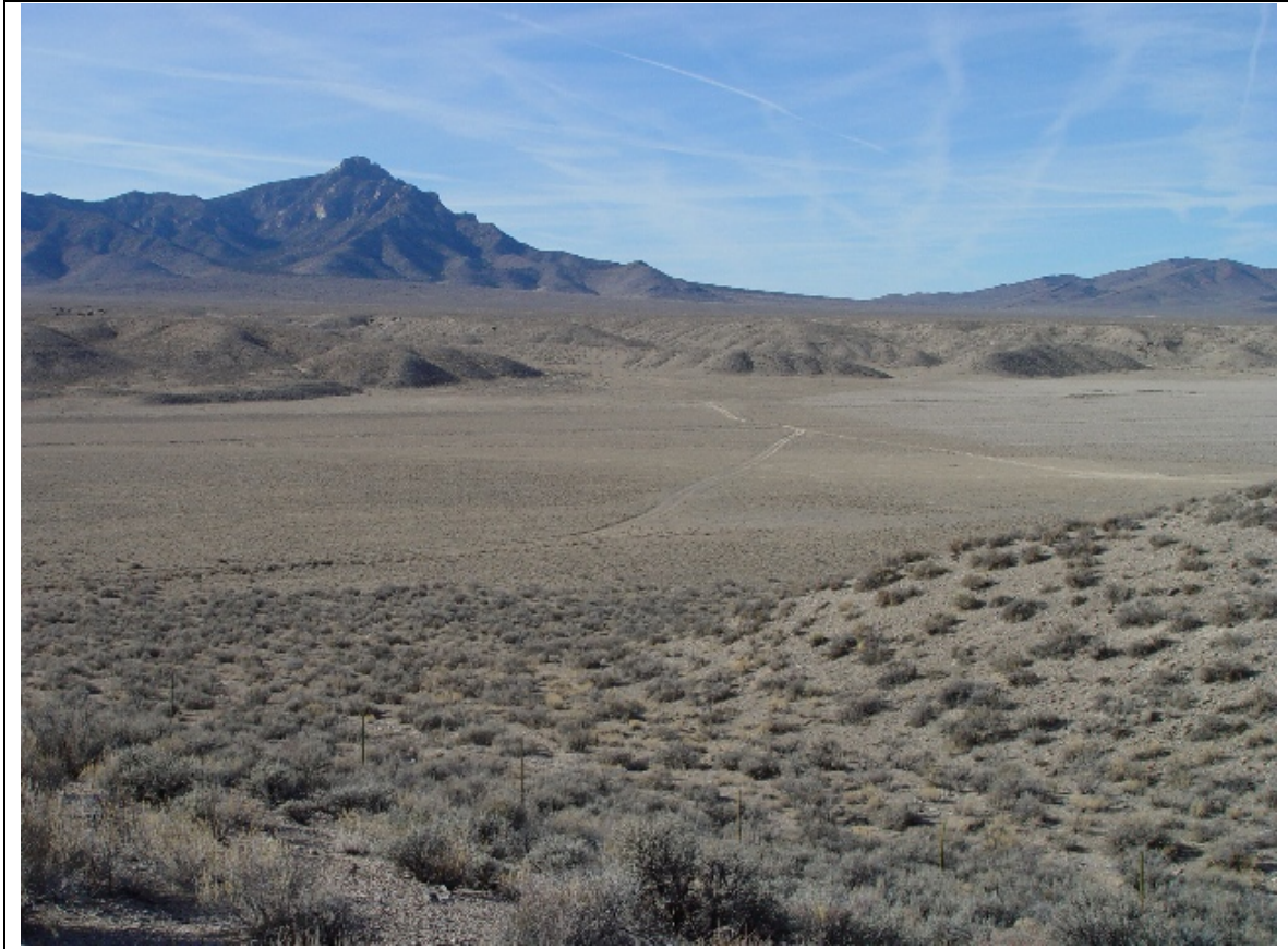
Fig. 4. Timber Mountain Pass

Caliente was the second-longest (319 miles), and most expensive ($880 million), of five rail access options identified by DOE. Carlin, the longest option, was 323 miles. Either of these routes would be considerably longer than the 113-mile Orin Line constructed by the Burlington Northern to access the Wyoming Powder River Basin coal fields in the 1970s. The Orin Line was the longest new track construction effort in the United States since the 1930s. (8) By way of further comparison, the Caliente route would be longer than the distance from Washington to New York (204 miles); St Louis to Chicago (259 miles); or London to Paris (213 miles). (13)