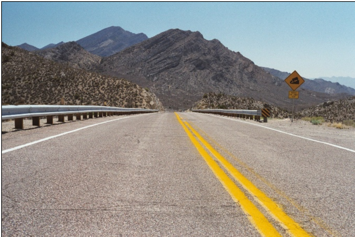
Fig. 2. Hancock Summit

Figure 1 shows the Caliente and Caliente-Chalk Mountain corridors. The Caliente corridor is located primarily within the Basin and Range Region of Nevada, which is divided by more than 150 North-South mountain ranges. (11) These North-South mountain ranges pose a considerable challenge to East-West railroad building. The original DOE Caliente rail route, which followed existing highways U.S. 93 and S.R. 375, was moved 40 miles north in 1992, in large part to avoid Hancock Summit through the Pahrnagat Range and Coyote Summit through the Timpahute Range. (12) Figure 2 shows Hancock Summit.