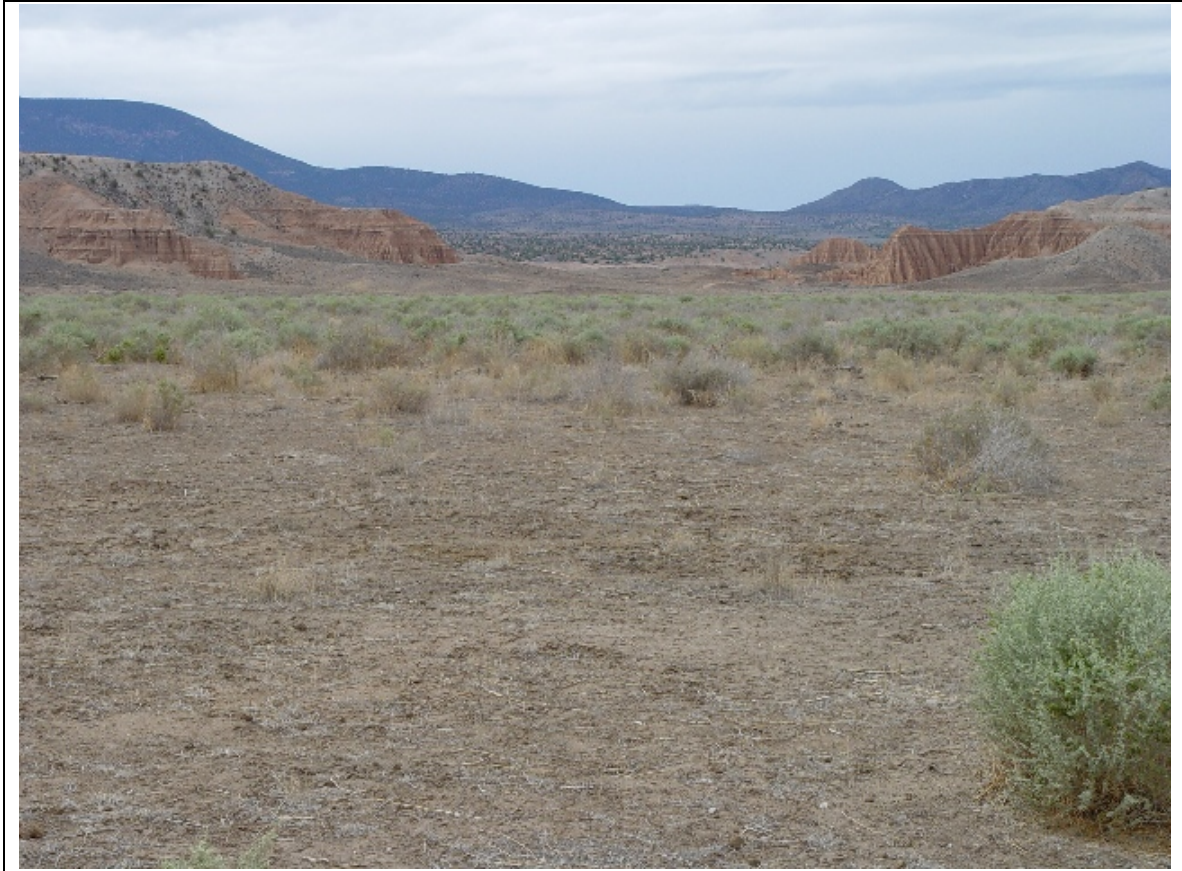
Fig. 3. Bennett Pass

DOE has not to our knowledge revealed a conceptual plan for a specific rail alignment within the current Caliente corridor. A conceptual plan and vertical profile are required for evaluation of feasibility and construction cost. A preliminary analysis of the first 100 miles, prepared for this paper based on previous DOE and Nevada studies, (6,7,8,12) indicates that DOE railroad construction and operation will be challenged by the rugged topography. The first four mountain crossing segments, ranging in length from 7 miles to more than 20 miles, would involve ascending and descending from valley elevations of 4,600 to 5,200 feet, to summit elevations of 5,400 to 6,100 feet. Figure 4 shows Timber Mountain Pass, the highest summit crossed in the first 100 miles. While a specific alignment has not yet been selected, almost any alignment within the proposed corridor will require grades of 1.3 percent to 2.4 percent for 75 of the first 100 miles, even after extensive cut-and-fill activity to limit maximum grades to 2.5 percent. DOE should expect to encounter similar conditions at other locations along the remaining 219 miles.